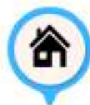
GORDON ANSTIS HOUSE, REDDITCH

We provide quality, affordable housing that supports our community. Our focus on fair rents ensures access to housing, regardless of income, across Worcestershire.