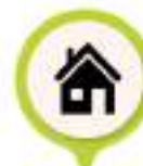
KNOWLE CLOSE, REDDITCH