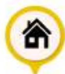
MORETON HOUSE, WORCESTER