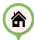
FORESTERS ARMS, WORCESTER