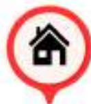
BEECH BANK, WORCESTER